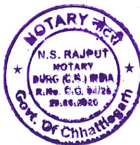
PHOTO COPY ATTESTED